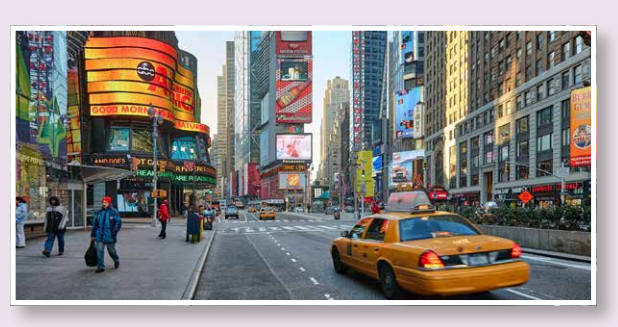
NEW YORK 30+